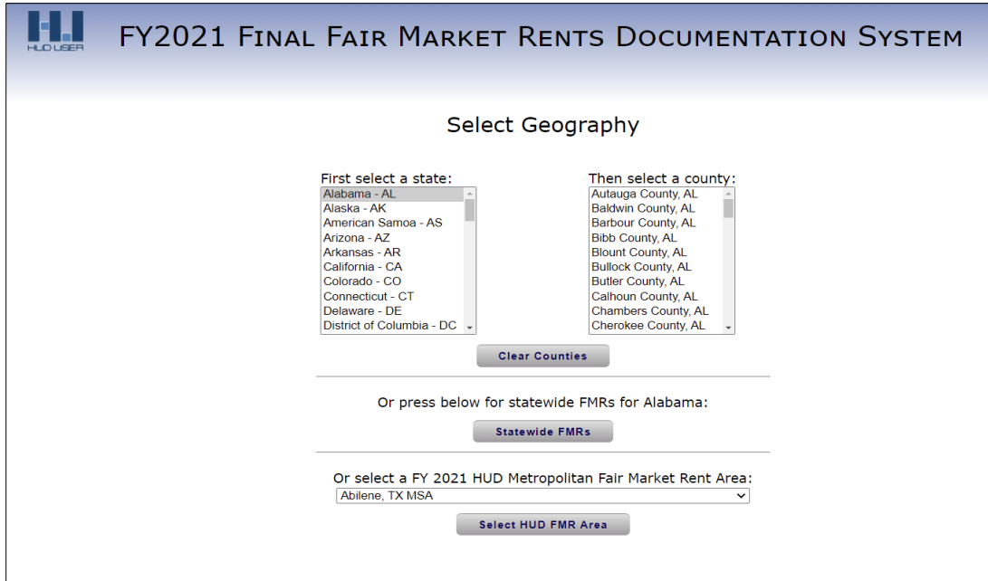
Figure 2: Screenshot of FMR Documentation System